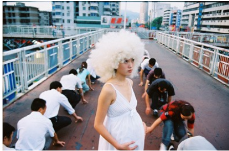
Jiang Zhi Postpause 9min, 2004

This short film is a visual feast of faces on streets and bridges, highlighting consumerism. An intriguing and surreal take on the city of Shenzhen.