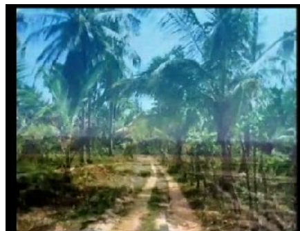
Tadeu Jungle Sempre tem mais 9min36, 2001

The influence of people in No-mans-land.